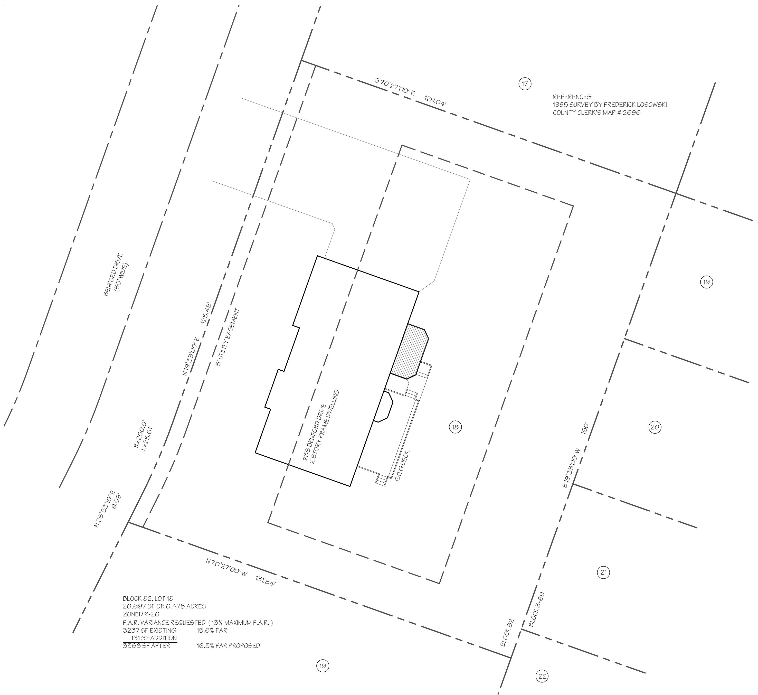
2 SITE PLAN CS SCALE: 1/16" = 1'-0"