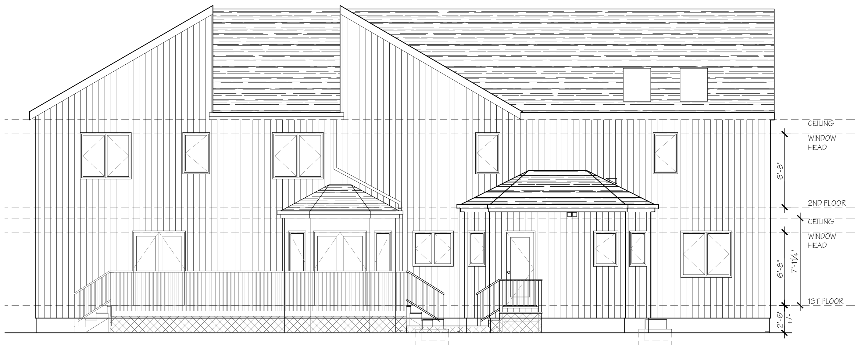
1 EXTERIOR ELEVATION, REAR CS SCALE: 3/16" = 1'-0"

REFERENCES: 1995 SURVEY BY FREDERICK LOSOWSKI COUNTY CLERK'S MAP # 2696